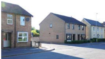
Site of old Church room, now entrance to Vicarage Close

To be continued in a future edition of Beach News. We have tried to gather some photos/pictures but if you have any from earlier times that we could use please let us know. We would scan any photos and then of course return them. If you are able to help please Tel: 01223 476601, email: beachnews@waterbeach.org or send to Beach News, 5 Spurgeons Avenue, Waterbeach, Cambridge CB25 9NU.