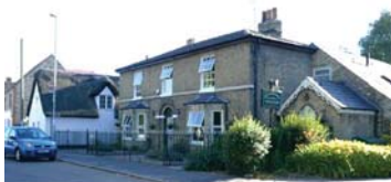
Now 'The Old School House' Bed & Breakfast - 2018