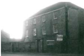
Old Vicarage, Greenside/High Street - 1974

The old vicarage was sited here and fetes were held in the grounds.