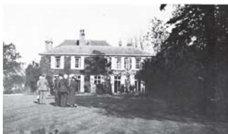
Garden at the rear of the old Vicarage – The large red wood tree on the right still stands today