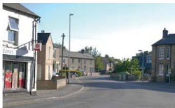
Chapel Street / Cambridge Road - 2018