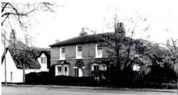
Previously the Parochial Junior School – photo from 1986

Arthur Hayes' market garden. Now the new chemist. The parochial school for juniors with a playground and school allotments to the rear. Now a guest house.