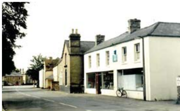
Co-op - Closed in 1989

Waddelow's grocery store. Later became the Co-Op. Now offices and flats.