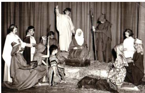
Christmas Nativity Play 1956. I am in the back standing second from left with head band and white undergarment

I originally moved to Waterbeach in November 1954 with my parents, as my father was an RAF Aircrew Officer and was posted to RAF Waterbeach, having spent 6 months in Australia on Atom bomb trials. We moved into a newly constructed Married Quarter in which we happily remained for the