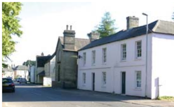
Greenside - 2018