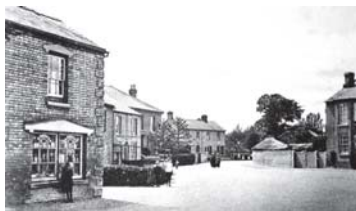
This area known as Towns End later became known as Chapel Street leading on to Cambridge Road

A brick-built building which served as the Headquarters of the Home Guard. The building is no longer there.