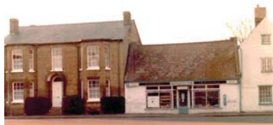
Gibson's - 1987