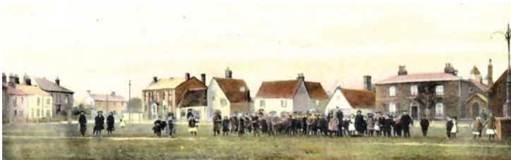
Waterbeach Green early 1900s