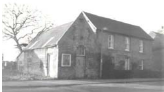
Old Church Room - 1984